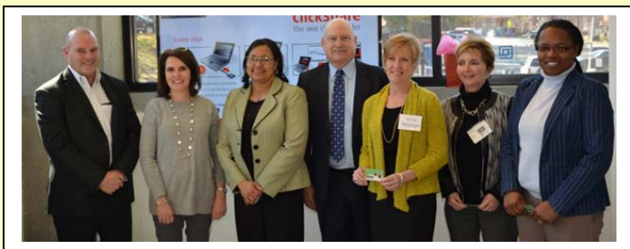
Members attending 1 st Zone Meeting